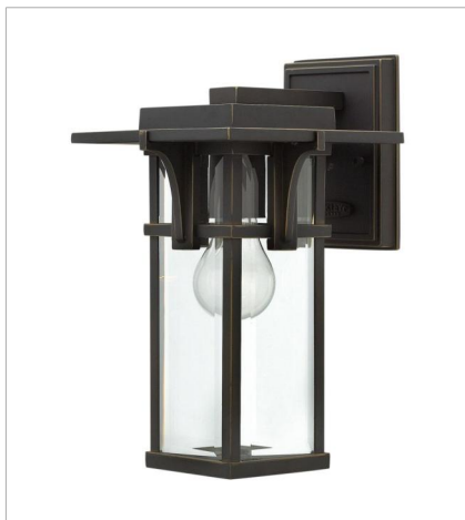
2320OZ SMALL WALL MOUNT LANTERN 7.3" W, 11.8" H Socketed 1-12w Med. LED, 100w Equiv.