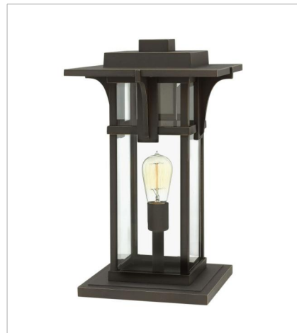
2327OZ-LV MEDIUM PIER MOUNT LANTERN 12V 11.3" W, 18.3" H Socketed 1-3.50w Med. LED *Included