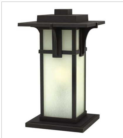
2237OZ LARGE PIER MOUNT LANTERN 11.3" W, 18.3" H Socketed 1-12w Med. LED, 100w Equiv.

FINISH: Oil Rubbed Bronze GLASS: Etched Seedy, Clear Beveled