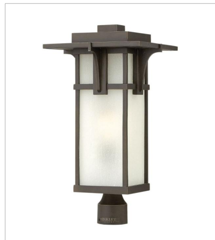
2231OZ LARGE POST TOP OR PIER MOUN... 11.3" W, 21.5" H Socketed 1-12w Med. LED, 100w Equiv.