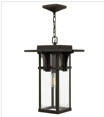
2322OZ LARGE HANGING LANTERN 11.3" W, 19.3" H Socketed 1-12w Med. LED, 100w Equiv.