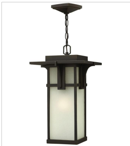
2232OZ LARGE HANGING LANTERN 11.3" W, 19.3" H Socketed 1-12w Med. LED, 100w Equiv.