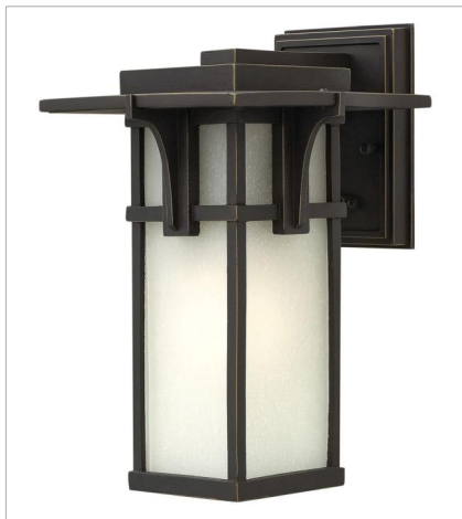
2230OZ SMALL WALL MOUNT LANTERN 7.3" W, 11.8" H Socketed 1-12w Med. LED, 100w Equiv.

FINISH: Oil Rubbed Bronze GLASS: Etched Seedy, Clear Beveled