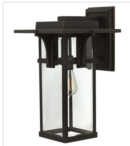
2325OZ LARGE WALL MOUNT LANTERN 11.3" W, 18.5" H Socketed 1-12w Med. LED, 100w Equiv.