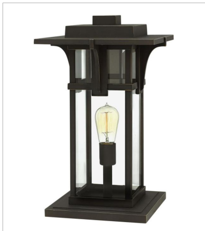
2327OZ LARGE PIER MOUNT LANTERN 11.3" W, 18.3" H Socketed 1-12w Med. LED, 100w Equiv.