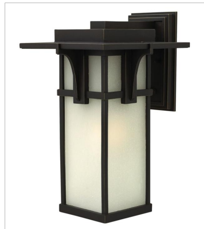
2235OZ LARGE WALL MOUNT LANTERN 11.3" W, 18.5" H Socketed 1-12w Med. LED, 100w Equiv.