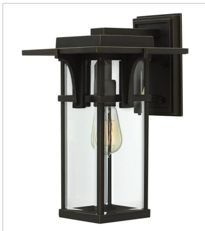
2324OZ MEDIUM WALL MOUNT LANTERN 9.3" W, 15" H Socketed 1-12w Med. LED, 100w Equiv.