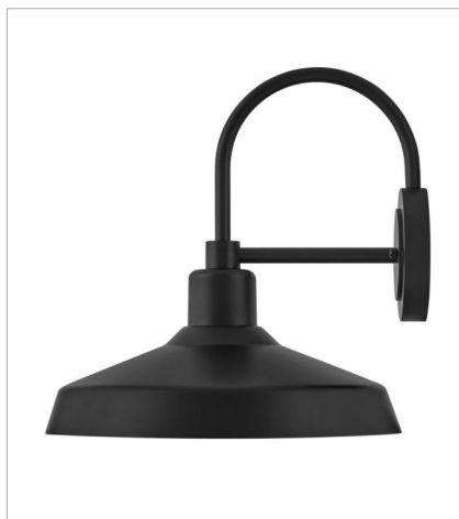
12070BK LARGE WALL MOUNT BARN LIGHT 16" W, 16.5" H Socketed 1-14w Med. LED, 100w Equiv.