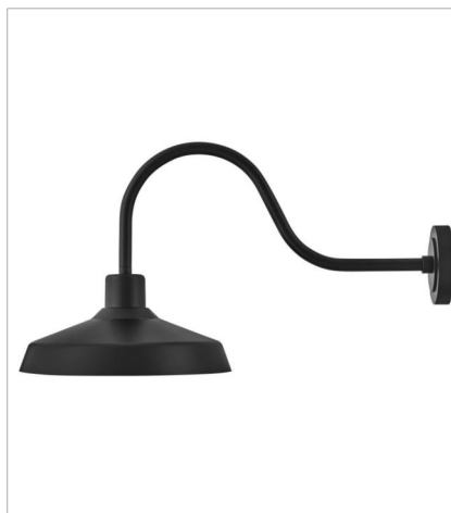
12074BK LARGE WALL MOUNT BARN LIGHT 16" W, 17.5" H Socketed 1-14w Med. LED, 100w Equiv.