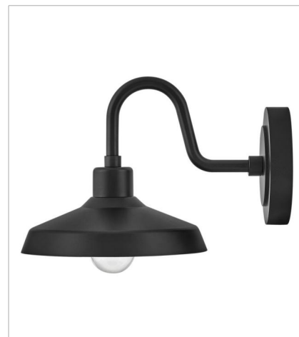
12076BK SMALL WALL MOUNT BARN LIGHT 9.5" W, 9" H Socketed 1-14w Med. LED, 100w Equiv.