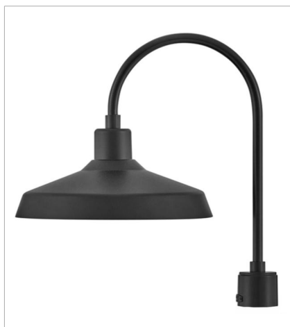
12071BK LARGE POST MOUNT LANTERN 16" W, 22" H Socketed 1-14w Med. LED, 100w Equiv.