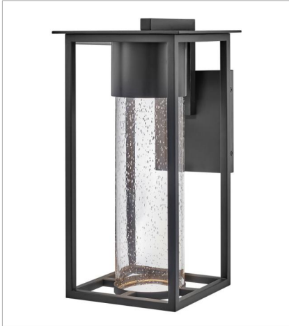
17020BK-LL MEDIUM WALL MOUNT LANTERN 8" W, 16" H Socketed 1-6.50w GU10 LED *Included