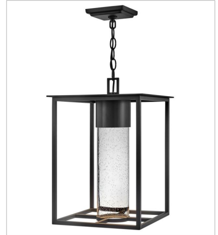
17022BK-LL MEDIUM HANGING LANTERN 12" W, 17.5" H Socketed 1-6.50w GU10 LED *Included