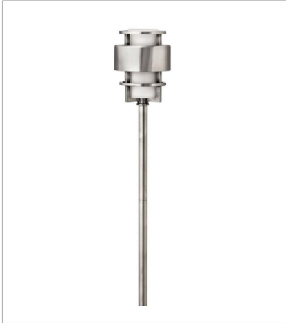
1579SS-LL LED PATH LIGHT 4.5" W, 22.3" H Socketed 1-2.50w T5 LED *Included

FINISH: Stainless Steel GLASS: Etched Opal