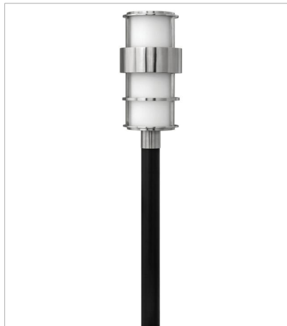
1901SS LARGE POST TOP OR PIER MOUN... 10" W, 21.8" H Socketed 1-12w Med. LED, 100w Equiv.