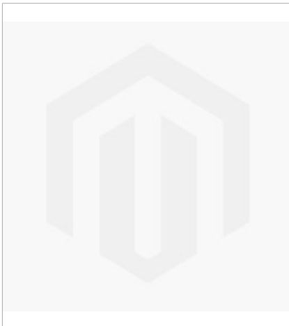
1905SS LARGE WALL MOUNT LANTERN 10" W, 20.3" H Socketed 1-12w Med. LED, 100w Equiv.