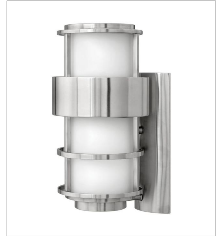
1904SS MEDIUM WALL MOUNT LANTERN 8" W, 16" H Socketed 1-12w Med. LED, 75w Equiv.