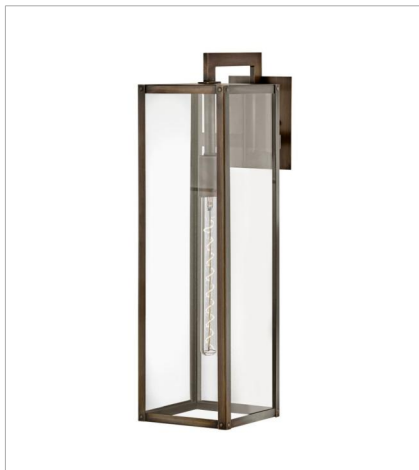
2595BU-LL LARGE WALL MOUNT LANTERN 7" W, 25" H Socketed 1-4w Med. LED *Included

FINISH: Burnished Bronze GLASS: Clear, Clear and Etched White (optional)