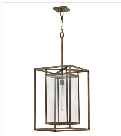
2592BU-LL EXTRA LARGE HANGING LANTERN 16.5" W, 40.8" H Socketed 1-4w Med. LED *Included

FINISH: Burnished Bronze GLASS: Clear, Clear and Etched White (optional)