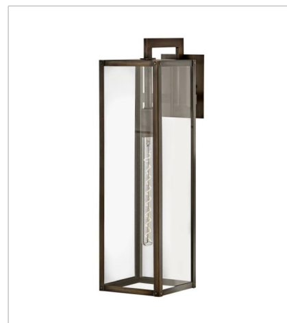
2595BU LARGE WALL MOUNT LANTERN 7" W, 25" H Socketed 1-12w Med. LED, 100w Equiv.