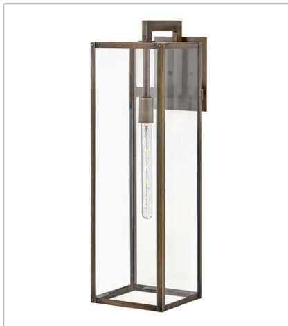
2598BU-LL LARGE WALL MOUNT LANTERN 9" W, 31" H Socketed 1-4w Med. LED *Included