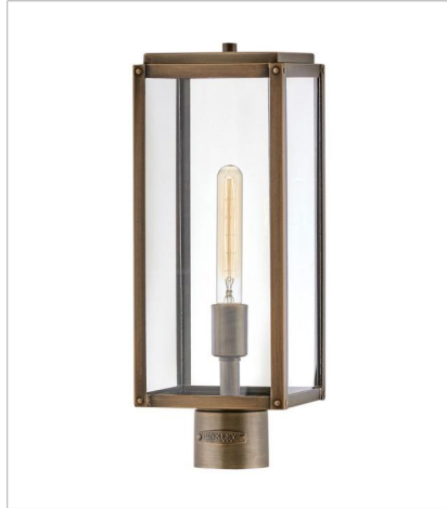
2591BU-LL MEDIUM POST MOUNT LANTERN 7" W, 18.5" H Socketed 1-2w Med. LED *Included