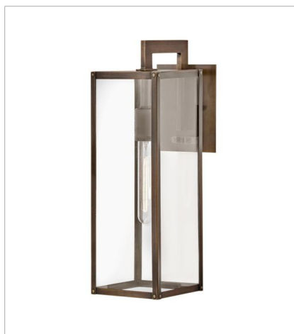
2594BU-LL MEDIUM WALL MOUNT LANTERN 6" W, 18.5" H Socketed 1-2w Med. LED *Included