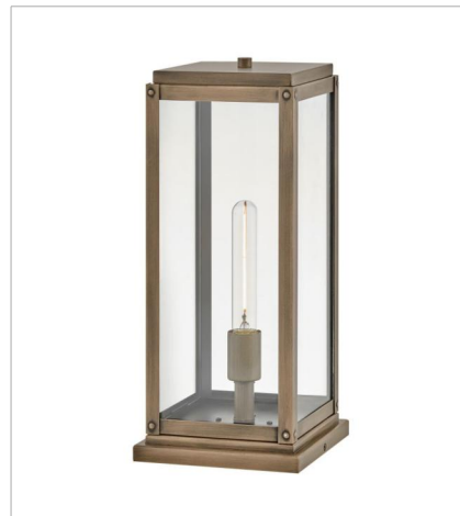
28857BU MEDIUM PIER MOUNT LANTERN 7.3" W, 17" H Socketed 1-8w Med. LED, 60w Equiv.