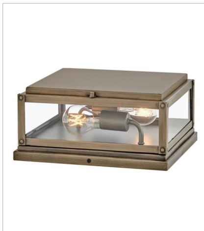
28858BU SMALL PIER MOUNT LANTERN 12" W, 7.5" H Socketed 2-8w Med. LED, 60w Equiv.