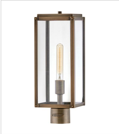
2591BU MEDIUM POST MOUNT LANTERN 7" W, 18.5" H Socketed 1-12w Med. LED, 100w Equiv.

FINISH: Burnished Bronze GLASS: Clear, Clear and Etched White (optional)