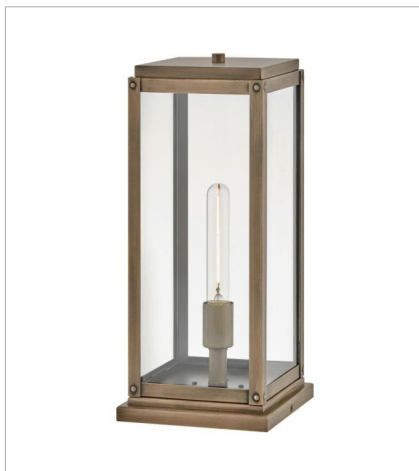
28857BU-LV MEDIUM PIER MOUNT LANTERN 7.3" W, 17" H Socketed 1-3.50w Med. LED *Included