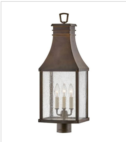
17461BLC LARGE POST MOUNT LANTERN 9" W, 26.3" H Socketed 3-5w Cand. LED, 60w Equiv.