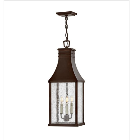
17462BLC LARGE HANGING LANTERN 9" W, 25.5" H Socketed 3-5w Cand. LED, 60w Equiv.