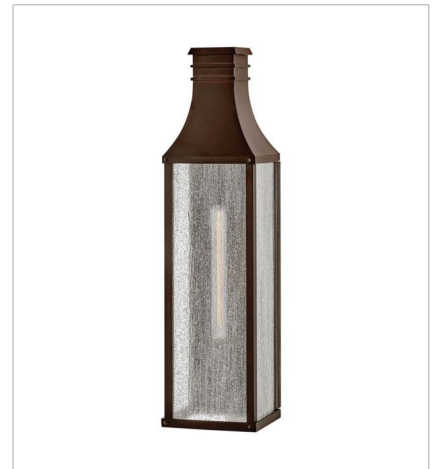
17469BLC-LL LARGE TALL WALL MOUNT LANTERN 8" W, 30" H Socketed 1-4w Med. LED *Included