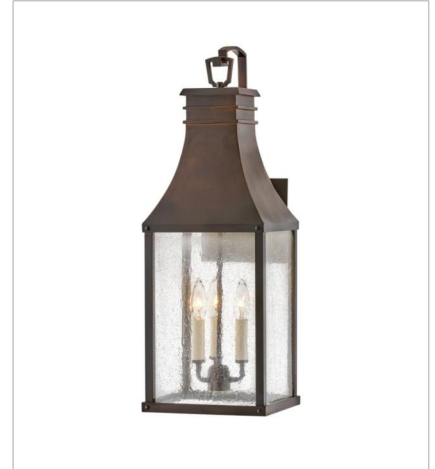
17465BLC LARGE WALL MOUNT LANTERN 9" W, 26.3" H Socketed 3-5w Cand. LED, 60w Equiv.