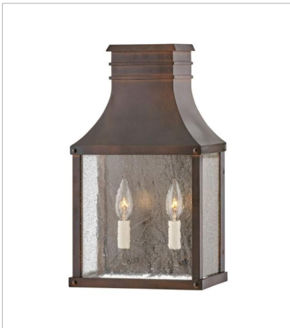
17466BLC MEDIUM WALL MOUNT LANTERN 9.8" W, 17.3" H Socketed 2-5w Cand. LED, 60w Equiv.