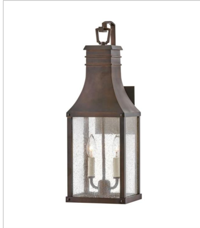
17464BLC LARGE WALL MOUNT LANTERN 7.8" W, 23" H Socketed 2-5w Cand. LED, 60w Equiv.