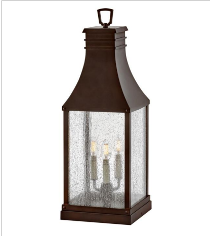
17467BLC LARGE PIER MOUNT LANTERN 9.5" W, 26.8" H Socketed 3-5w Cand. LED, 60w Equiv.

FINISH: Blackened Copper GLASS: Clear Seedy