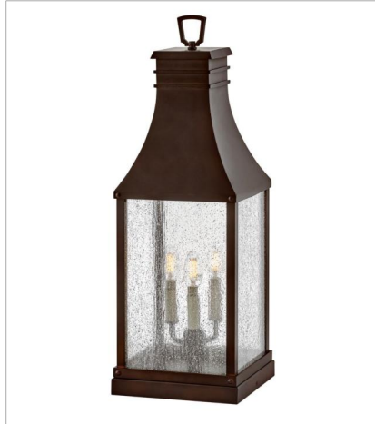
17467BLC-LV LARGE PIER MOUNT LANTERN 12V 9.5" W, 26.8" H Socketed 3-3.50w Cand. LED *Included