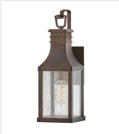
17460BLC MEDIUM WALL MOUNT LANTERN 5.8" W, 18" H Socketed 1-12w Med. LED, 100w Equiv.

FINISH: Blackened Copper GLASS: Clear Seedy