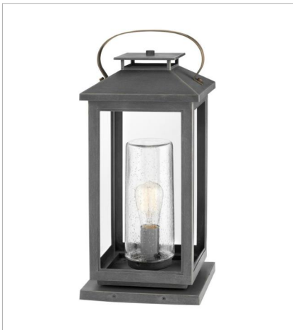
1167AH MEDIUM PIER MOUNT 9.5" W, 21.5" H Socketed 1-10w Med. LED, 100w Equiv.