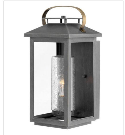
1164AH-LL MEDIUM WALL MOUNT LANTERN 8.3" W, 17.5" H Socketed 1-2w Med. LED *Included