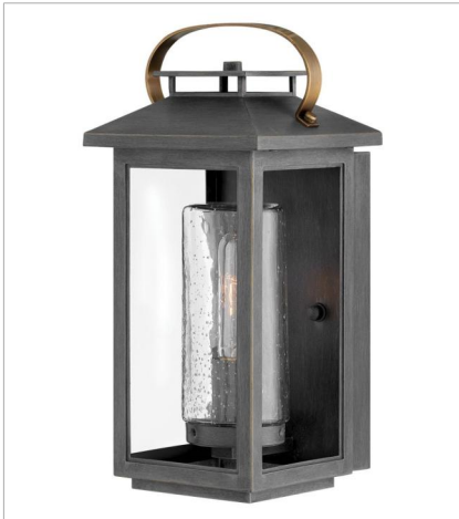
1160AH SMALL WALL MOUNT LANTERN 6.5" W, 14" H Socketed 1-10w Med. LED, 100w Equiv.