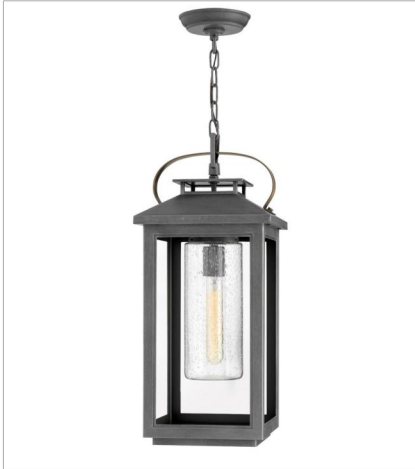
1162AH-LL LARGE HANGING LANTERN 9.5" W, 21.5" H Socketed 1-2w Med. LED *Included