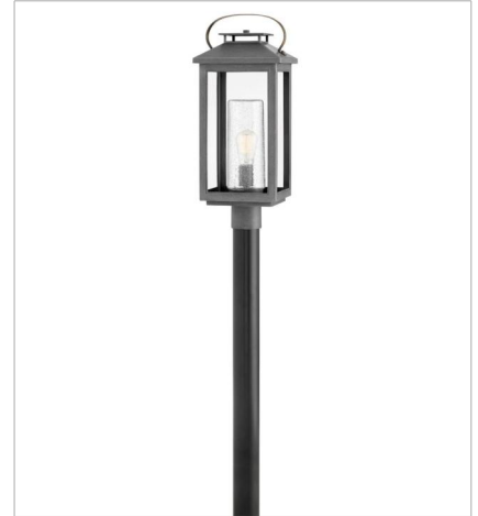
1161AH-LL LARGE POST MOUNT LANTERN 9.5" W, 23" H Socketed 1-2w Med. LED *Included