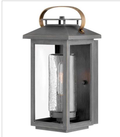
1160AH-LL MEDIUM WALL MOUNT LANTERN 6.5" W, 14" H Socketed 1-2w Med. LED *Included