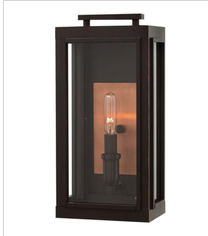
29100Z-LL SMALL WALL MOUNT LANTERN 7" W, 14" H Socketed 1-2w Cand. LED *Included