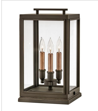
2917OZ-LL LARGE PIER MOUNT LANTERN 10.3" W, 18" H Socketed 3-2w Cand. LED *Included