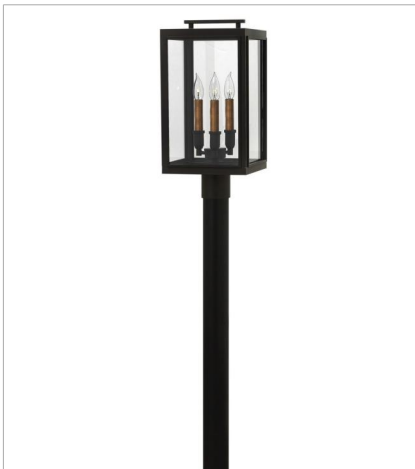
2911OZ LARGE POST TOP OR PIER MOUN... 10" W, 20" H Socketed 3-5w Cand. LED, 60w Equiv.