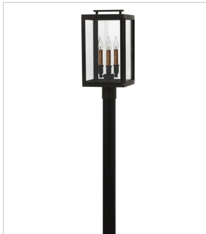
2911OZ-LL LARGE POST TOP OR PIER MOUN... 10" W, 20" H Socketed 3-2w Cand. LED *Included