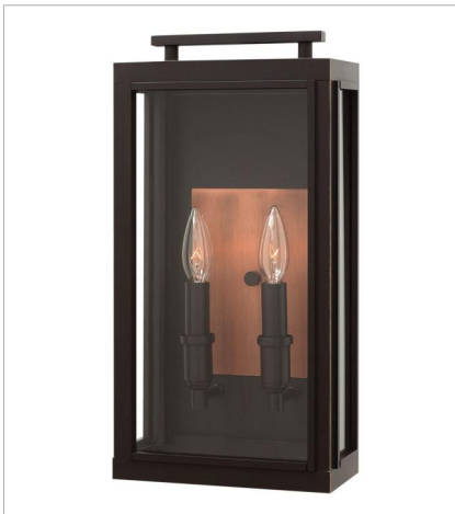
29140Z-LL MEDIUM WALL MOUNT LANTERN 9" W, 17" H Socketed 2-2w Cand. LED *Included