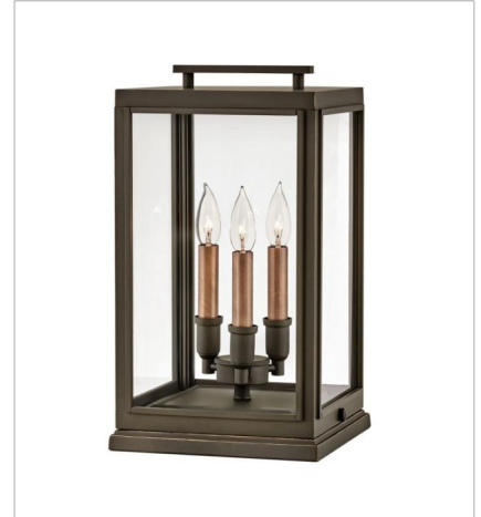
2917OZ-LV MEDIUM PIER MOUNT LANTERN 12V 10.3" W, 18" H Socketed 3-3.50w Cand. LED *Included