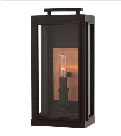
29100Z SMALL WALL MOUNT LANTERN 7" W, 14" H Socketed 1-5w Cand. LED, 60w Equiv.

FINISH: Oil Rubbed Bronze with Antique Copper accents GLASS: Clear