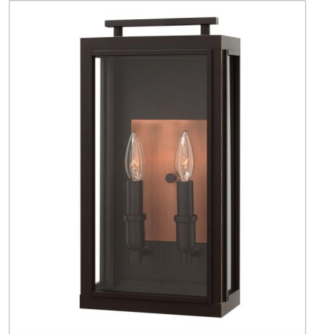
29140Z MEDIUM WALL MOUNT LANTERN 9" W, 17" H Socketed 2-5w Cand. LED, 60w Equiv.