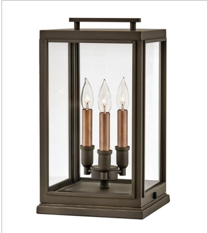
2917OZ LARGE PIER MOUNT LANTERN 10.3" W, 18" H Socketed 3-5w Cand. LED, 60w Equiv.

FINISH: Oil Rubbed Bronze with Antique Copper accents GLASS: Clear