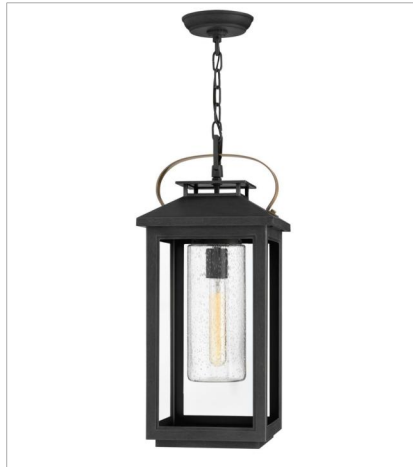
1162BK-LL LARGE HANGING LANTERN 9.5" W, 21.5" H Socketed 1-2w Med. LED *Included