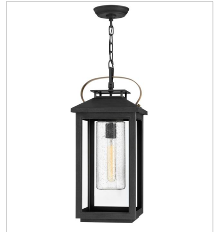
1162BK-LV LARGE HANGING LANTERN 12V 9.5" W, 21.5" H Socketed 1-3.50w Med. LED *Included