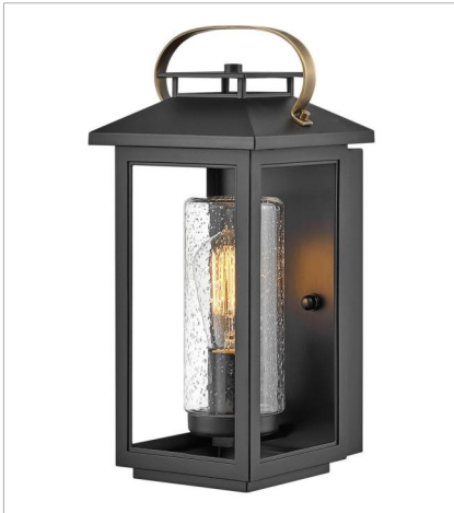
1160BK SMALL WALL MOUNT LANTERN 6.5" W, 14" H Socketed 1-10w Med. LED, 100w Equiv.