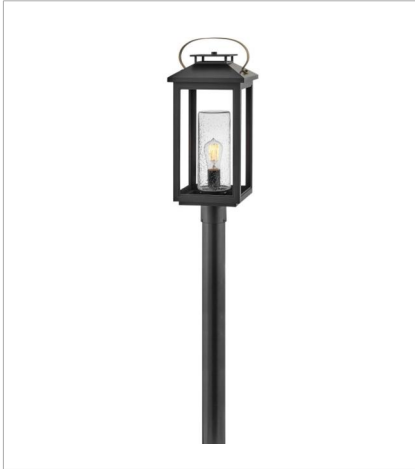
1161BK MEDIUM POST OR PIER MOUNT L... 9.5" W, 23" H Socketed 1-10w Med. LED, 100w Equiv.