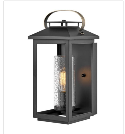
1164BK MEDIUM WALL MOUNT LANTERN 8.3" W, 17.5" H Socketed 1-10w Med. LED, 100w Equiv.