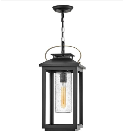
1162BK MEDIUM HANGING LANTERN 9.5" W, 21.5" H Socketed 1-10w Med. LED, 100w Equiv.