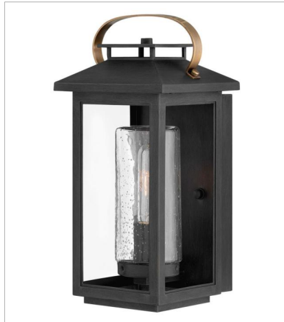
1160BK-LL MEDIUM WALL MOUNT LANTERN 6.5" W, 14" H Socketed 1-2w Med. LED *Included