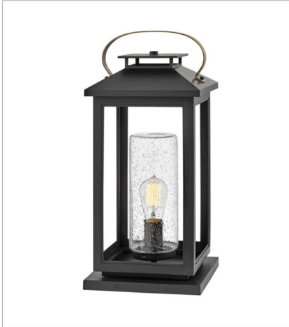
1167BK MEDIUM PIER MOUNT 9.5" W, 21.5" H Socketed 1-10w Med. LED, 100w Equiv.