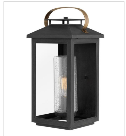
1165BK-LL MEDIUM WALL MOUNT LANTERN 9.5" W, 20.5" H Socketed 1-2w Med. LED *Included