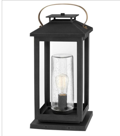
1167BK-LL LARGE PIER MOUNT LANTERN 9.5" W, 21.5" H Socketed 1-2w Med. LED *Included