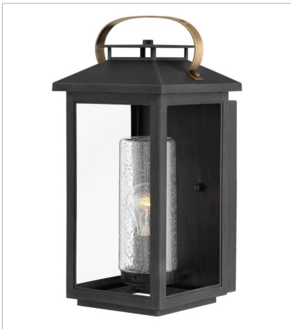
1164BK-LL MEDIUM WALL MOUNT LANTERN 8.3" W, 17.5" H Socketed 1-2w Med. LED *Included