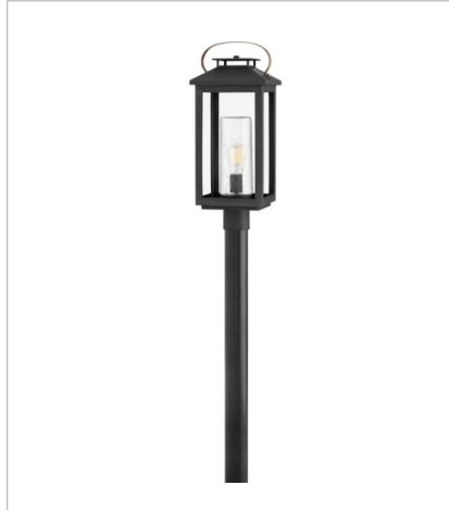
1161BK-LL LARGE POST MOUNT LANTERN 9.5" W, 23" H Socketed 1-2w Med. LED *Included