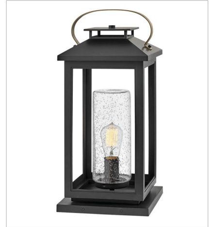
1167BK-LV LARGE PIER MOUNT LANTERN 12V 9.5" W, 21.5" H Socketed 1-3.50w Med. LED *Included