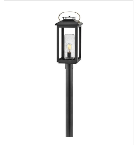
1161BK-LV LARGE POST MOUNT LANTERN 12V 9.5" W, 23" H Socketed 1-3.50w Med. LED *Included