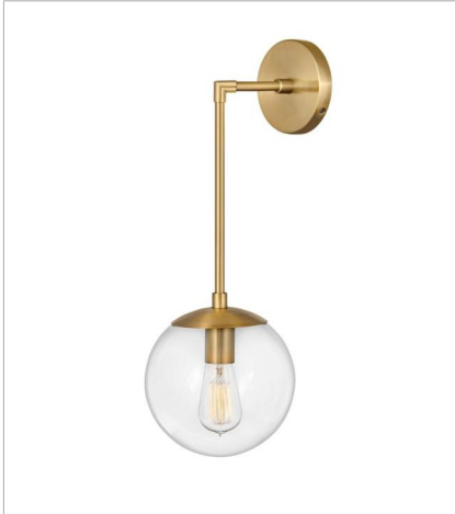
3742HB LARGE SINGLE LIGHT SCONCE 8" W, 21.8" H Socketed 1-10w Med. LED, 100w Equiv.

FINISH: Heritage Brass GLASS: Clear, Cased Opal