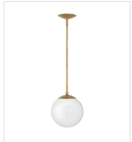
3747HB-WH SMALL PENDANT 9.5" W, 10.8" H Socketed 1-10w Med. LED, 100w Equiv.