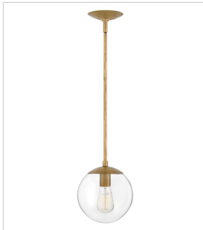
3747HB SMALL PENDANT 9.5" W, 10.8" H Socketed 1-10w Med. LED, 100w Equiv.