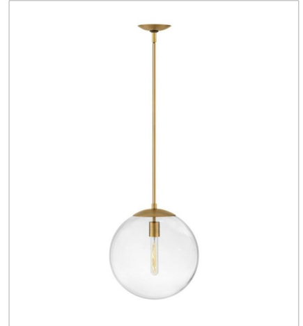
3744HB MEDIUM ORB PENDANT 13.5" W, 14.3" H Socketed 1-12w Med. LED, 100w Equiv.