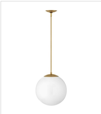
3744HB-WH MEDIUM ORB PENDANT 13.5" W, 14.3" H Socketed 1-12w Med. LED, 100w Equiv.