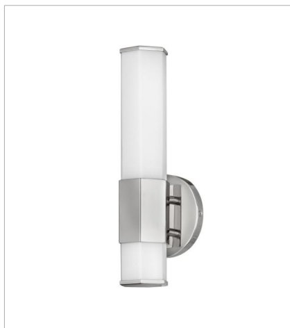
51150PN SMALL LED SCONCE 5" W, 14" H Integrated LED 16w LED *Included

FINISH: Polished Nickel GLASS: Etched Opal