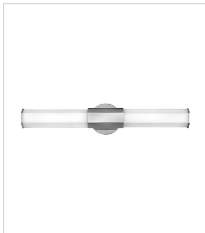
51152PN MEDIUM LED VANITY 26" W, 5" H Integrated LED 32w LED *Included