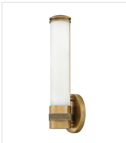
5070CR SMALL LED SCONCE 4.8" W, 14.3" H Integrated LED 17w LED *Included

FINISH: Champagne Bronze GLASS: Etched White