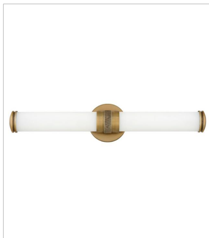
5073CR MEDIUM LED VANITY 23.8" W, 4.8" H Integrated LED 36w LED *Included