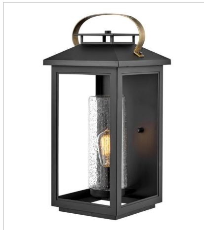
1165BK LARGE OUTDOOR WALL MOUNT LA... 9.5" W, 20.5" H Socketed 1-10w Med. LED, 100w Equiv.