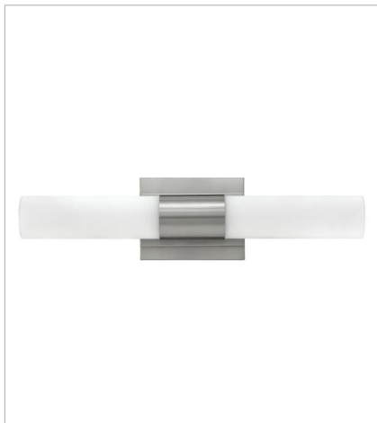
52112BN SMALL LED VANITY 19" W, 4.8" H Integrated LED 16w LED *Included

FINISH: Brushed Nickel GLASS: Etched Opal