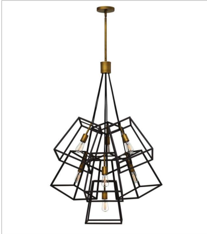
3357BZ SEVEN LIGHT MULTI TIER 27.8" W, 46.3" H Socketed 7-14w Med. LED, 100w Equiv.

FINISH: Bronze with Heirloom Brass accents