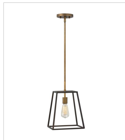
3351BZ LARGE OPEN FRAME PENDANT 10" W, 12.3" H Socketed 1-14w Med. LED, 100w Equiv.