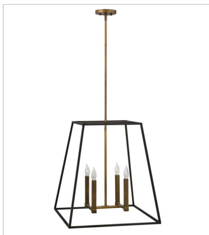
3336BZ LARGE OPEN FRAME 22" W, 24.5" H Socketed 4-5w Cand. LED, 60w Equiv.