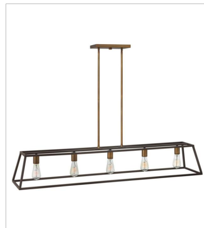
3335BZ FIVE LIGHT OPEN FRAME LINEAR 10.5" W, 9" H Socketed 5-14w Med. LED, 100w Equiv.