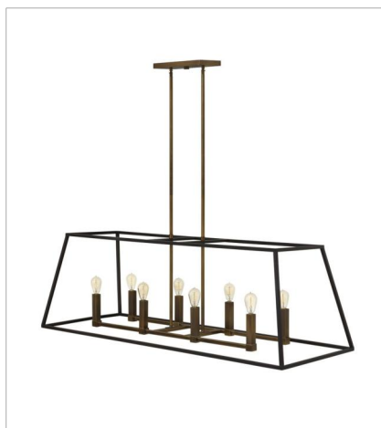
3338BZ EIGHT LIGHT OPEN FRAME LINEAR 48" W, 16.3" H Socketed 8-5w Cand. LED, 60w Equiv.