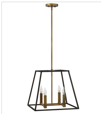
3334BZ MEDIUM OPEN FRAME PENDANT 18" W, 16.3" H Socketed 4-5w Cand. LED, 60w Equiv.